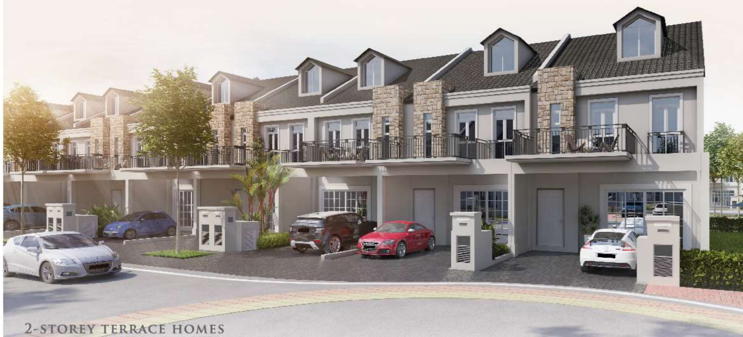
2-STOREY TERRACE HOMES